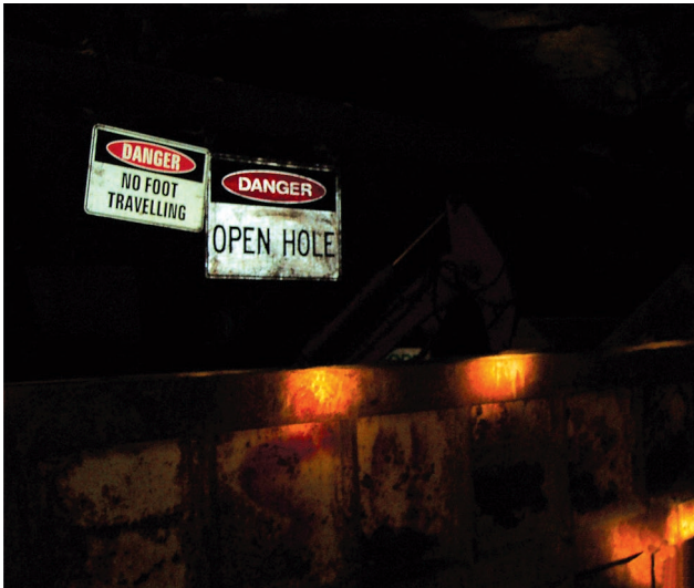
Bulkhead and signage isolating a disused ore pass

When a grizzly is installed on a pass, provision of a safety belt, preferably the inertia reel type (e.g. Sala block), is essential to ensure the safety of any person who works on the grizzly. This equipment must be properly installed, inspected and maintained, and inertia reels checked regularly by a competent person.