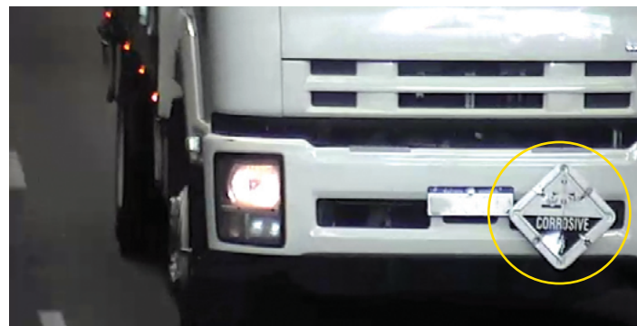
Example of a placarded vehicle. This vehicle must not enter the Northbridge Tunnel.

If you are no longer carrying a placard load, please ensure you revise the placarding on your vehicle.